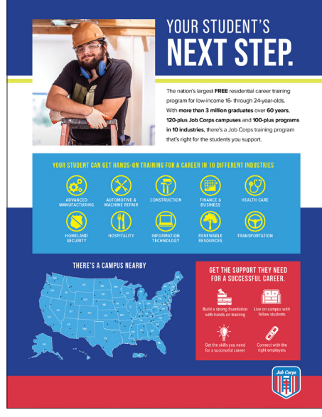
Expedited Enrollment flier

If you have questions about how to access or use these materials, please reach out to jobcorpsmaterials@mpf.com.